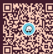
IOI Galleria @ Bandar Putra Kulai

THIS ADVERTISEMENT HAS BEEN APPROVED BY THE NATIONAL HOUSING DEPARTMENT DEVELOPMENT INFORMATION AND APPROVED ADVERTISEMENTS ARE AVAILABLE ON TEDUH.KPKT.GOV.MY PORTAL