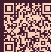
Scan here for more info

+607-5959 155 ioiproperties.com.my/veena