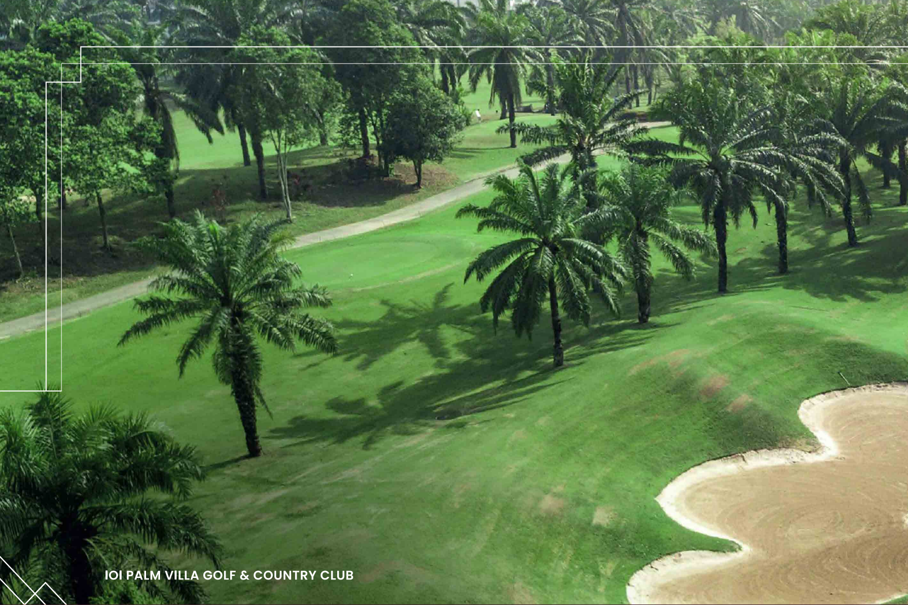
IOI PALM VILLA GOLF & COUNTRY CLUB