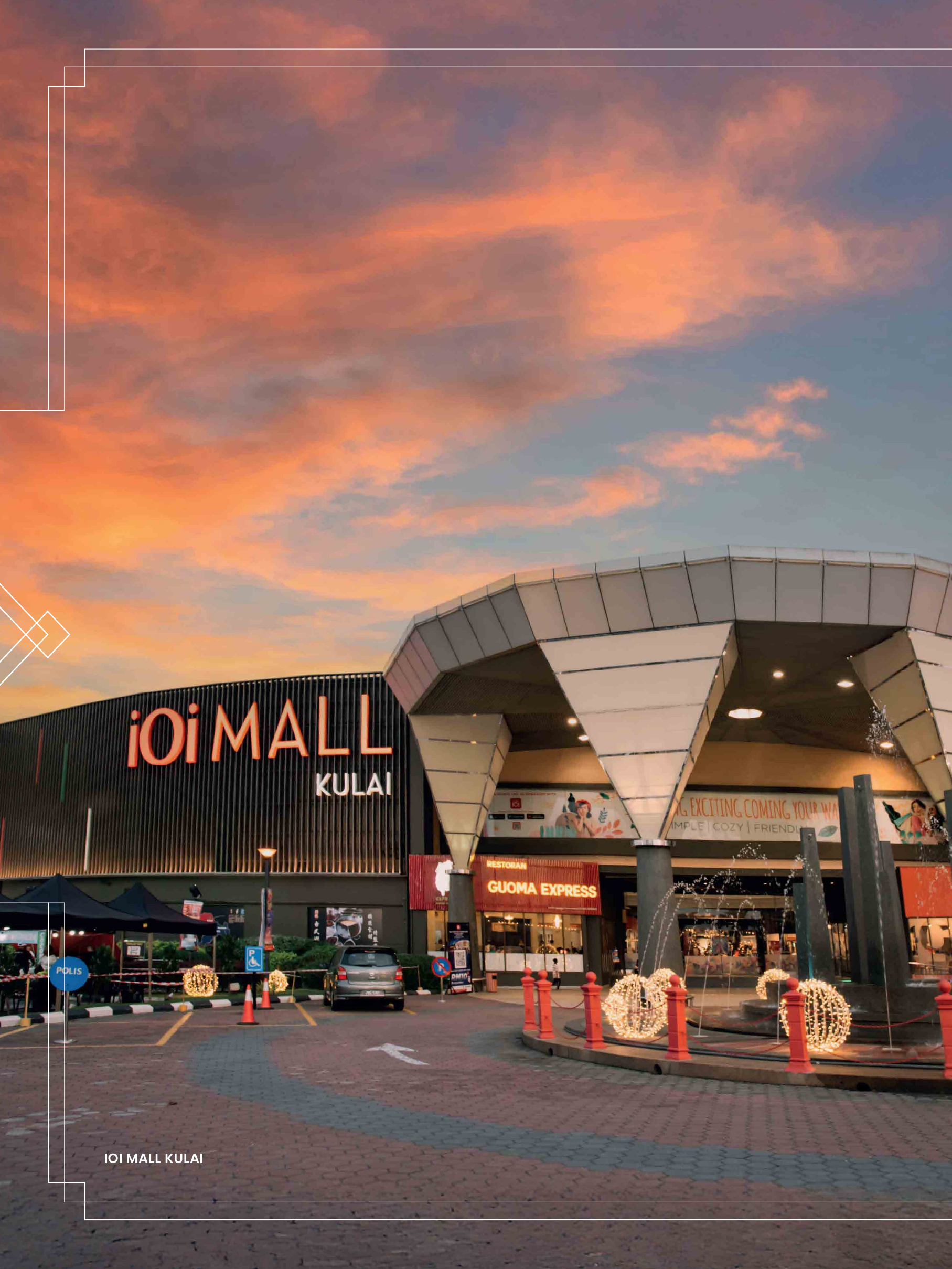
IOI MALL KULAI